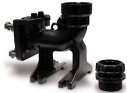
All product images are indicative only